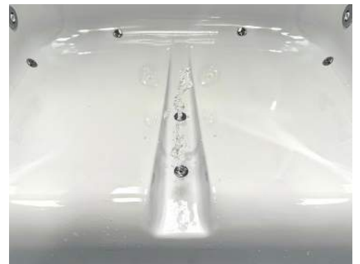
Auto-Purge Shown Above