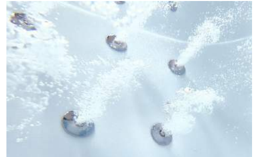
Hydro Jets Shown