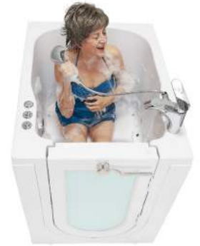
Front Entry Model Shown Above

Air and Hydro Therapy Massage Option with Ella 2 Piece Fast-Fill Faucet