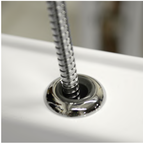
Water from the hose can drip down into the hand shower base and get behind your tub without the barrel protection.

NOTE: Do not attach the handheld shower to the wall unless you have an extension hose with a barrel protection. This may cause water to leak behind your walk-in tub.