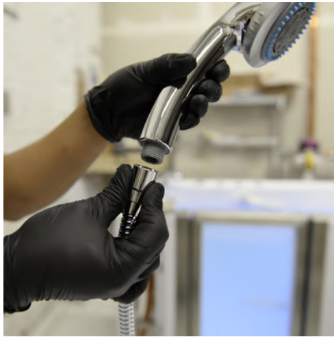
1) Start by unscrewing your shower head mixer from the hose.