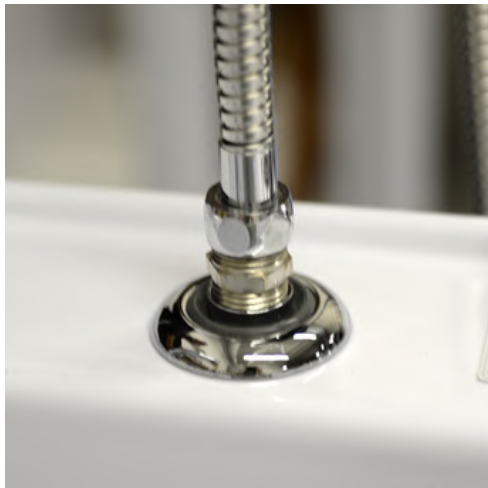
4) Place the barrel in the shower base to plug the hole.