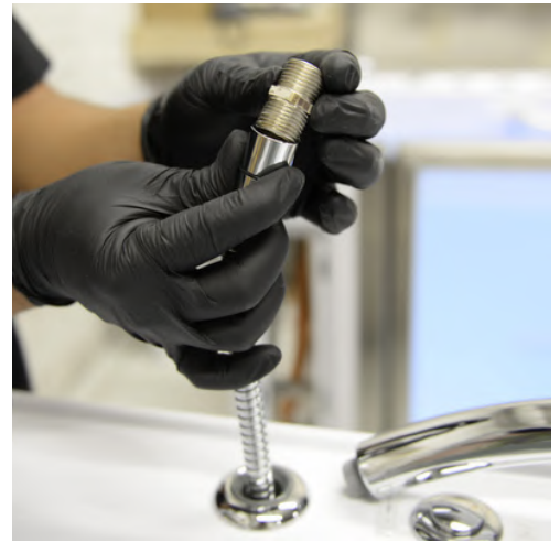
2) Next take your stainless steel barrel and screw it on the end of the hose.