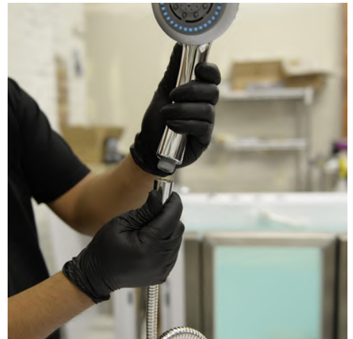
5) Finally, screw on the shower head mixer to the other end of the extension hose.