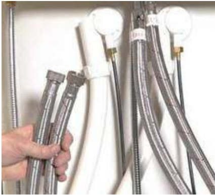
Connect to Shut Off Valves (not included)

Two 3/4" connector water supply lines included with Ella Fast Fill Faucets