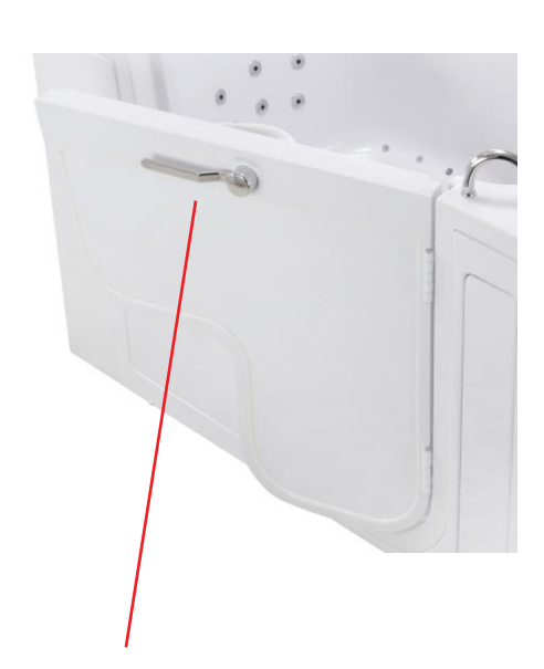
1. Door Handle (pictured is open, turn clockwise to close)