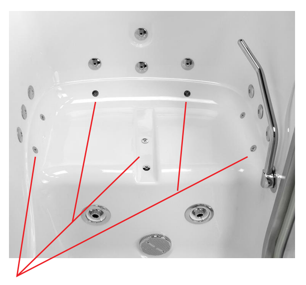
5. Air Jets